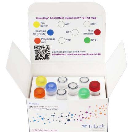
Figure 1. CleanCap® AG (3' OMe) CleanScript™ IVT Kit